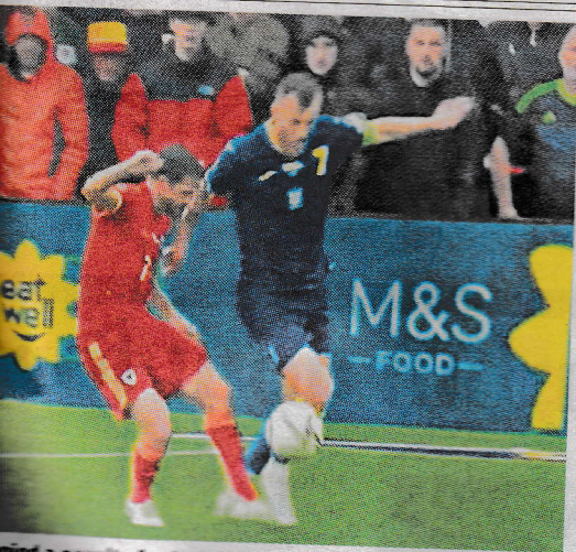
...ried a penalty for Joe Allen's tackle on Andriy Yarmolenko

"The Russians want to hurt us but Ukrainians are defending their land. We just want your support, we want your understanding of what is happening at home. God forbid you will ever understand what we feel inside."