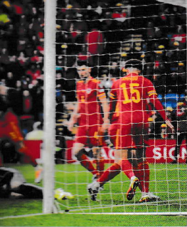
...essey yn llwyddo ...rain rhag sgorio