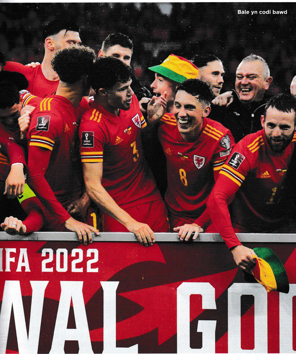
Bale yn codi bawd

...llwyr! ...Wedi'r chwiban olaf, ...dychwelodd Dafydd Iwan i'r ...cae ac y tro hwn roedd holl ...chwaraewyr Cymru yn canu ...'Yma o Hyd' gydag ef. ...‘Ydw i'n breuddwydio?’ ...Meddyliais. ...Na, mae Cymru ‘Yma o Hyd’ ...ac yn mynd i Gwpan y Byd!