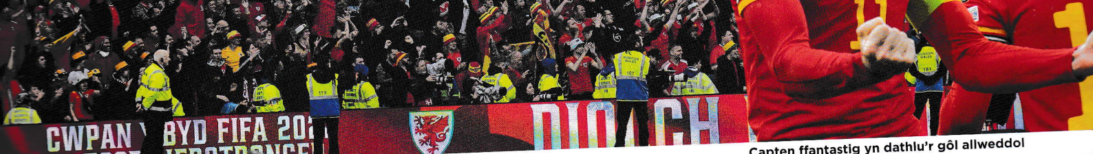
Capten ffantastig yn dathlu'r gôl allweddol

D w i'n teimlo fel fy mod i newydd fynd deuddeg rownd efo Mike Tyson!" Dyna eiriau cyn-ymosodwr Cymru, Iwan Roberts, ar raglen ffonio-i-fewn Radio Wales toc wedi'r fuddugoliaeth fawr yn erbyn Wcrain nos Sul. Ac roedd sawl un yn teimlo'r un fath.