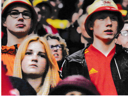
Cefnogwyr yn aros am y chwiban olaf

...inio o amgylch Stadiwm ...as Caerdydd yn gyson yn ...od y gêm, ac fe fyddai'r dyn ...un yn falch iawn o weld ...gwlad yn cyrraedd y greal ...ctaidd o'r diwedd. ...Wrth i'r chwiban olaf agosáu, ...ydag Wcraïn yn gwthio i ...oni'r sgôr, roedd y tensiwn yn ...stadiwm yn cyrraedd lefelau ...niddefol. ...D fy nghwmpas roedd dynion ...eu hoed a'u hamser mewn