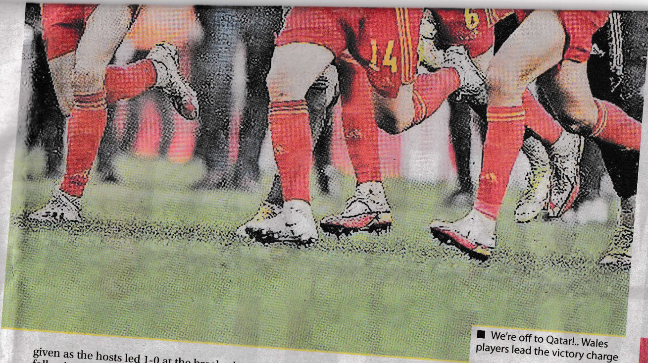
■ We're off to Qatar!.. Wales players lead the victory charge

given as the hosts led 1-0 at the break following a nerve-shredding 45.