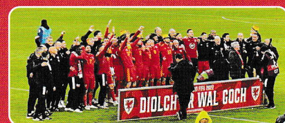
Dafydd Iwan a'r hogiau yn dathlu

Roedd y garfan o chwaraewyr oedd yn canu gyda Dafydd Iwan yn cynrychioli Cymru newydd. Gwlad flaengar, amrywiol a chynhwysol. Gwlad gyda hunanhyder a hunan-barch. Gwlad sydd yn mynd i Qatar i chwarae yng Nghwpan y Byd.